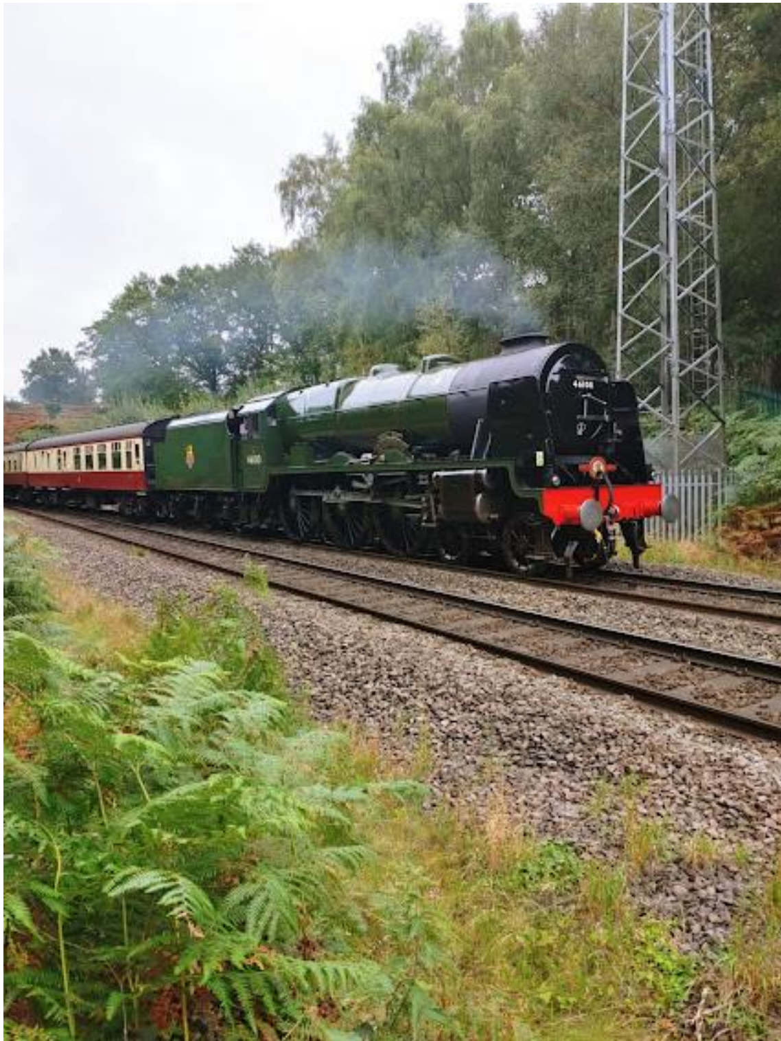
46100 Royal Scot creeps under Common Lane bridge into the passing loop at Kenilworth Junction on Saturday 4th September 2021. This was an excursion from Crewe to Salisbury which travelled south via Birmingham, Coventry and Leamington Spa.

A very short video clip 46100 Royal Scot passing through Kenilworth Station at about 2045hrs on Saturday 4th September 2021. This was a late running return working of an excursion from Crewe to Salisbury which travelled south via Birmingham, Coventry and Leamington Spa on Saturday morning.