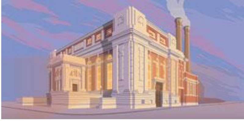
The Engine House