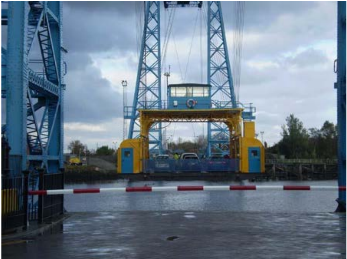
OLYMPUS DIGITAL CAMERA