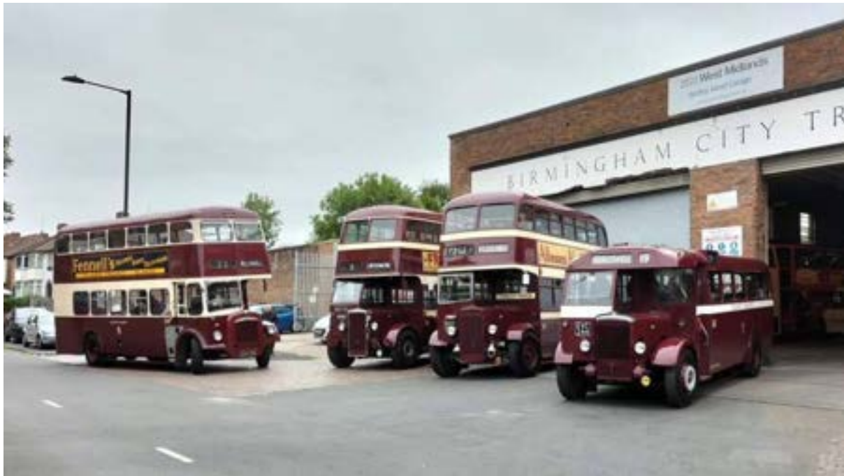
A collection of Coventry Transport vehicles at Yardley Wood Garage, Birmingham.

WIAS MOLE. The WIAS MOLE, (Monthly On Line Edition), was launched in September 2021 to keep the WIAS on line community in touch with news and views on the industrial heritage of Warwickshire and beyond. A printed version was sent to those without internet access. It was always intended as an experiment and after the first three issues, we are in a position where social distancing is diminishing and access to sites, museums etc is easier, so we shall not continue with further editions. Any crucial pieces of information will be sent out by e-mail, but only on an occasional basis. The 3 editions of the MOLE are reproduced at this link . Use the small tool bar at the bottom of the screen to enlarge, zoom, flip pages etc.