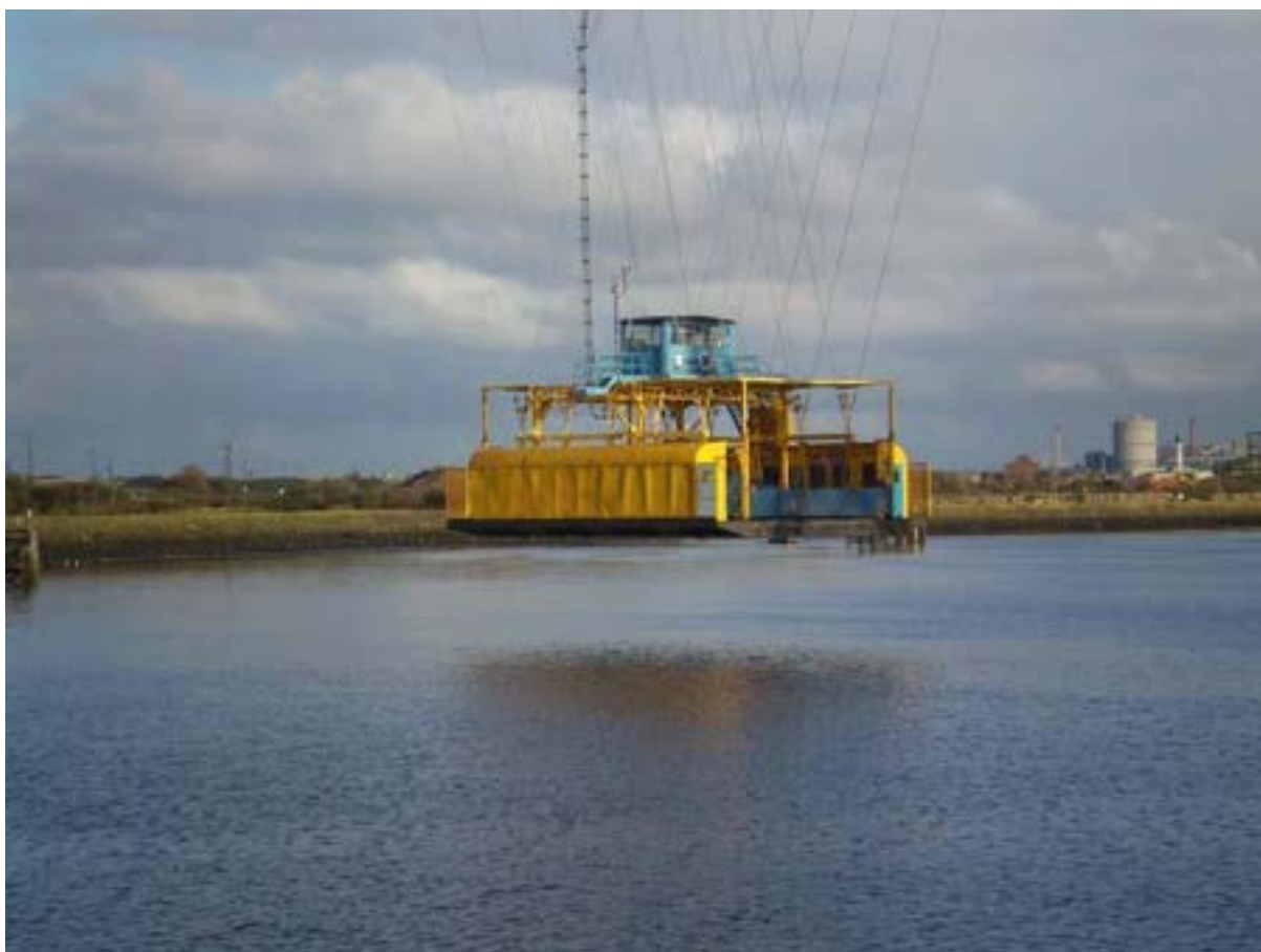
OLYMPUS DIGITAL CAMERA Middlesbrough Transporter Bridge in the 1980's