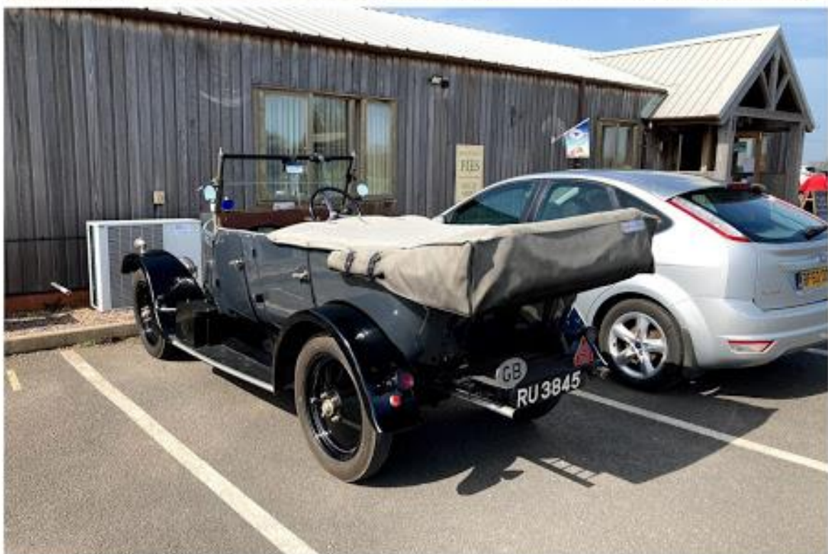
RU 3845 Singer 10-26 (1926)