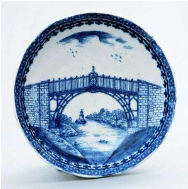
A saucer made at the Caughley factory circa, 1782-94

(The original engraving, shown above, was acquired by the British Museum in 1870 but is not on display. For full details click on this link ).