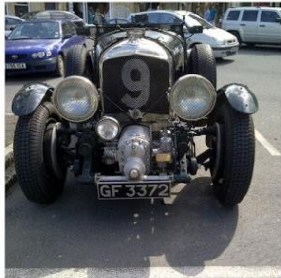
1929 Bentley 3 litre DS 6579 at Le Touquet beach in 2006 and 1930 Bentley 4 1/2 litre GF 3372 at Stowe on the Wold in 2013

GPO Marker Post etc. This web site is dedicated to those cast iron pieces of street furniture that almost always go un-noticed, but are reminders of our social, technological and physical past. Marker posts of a standard design were used by the Post Office (later known as the General Post Office, or GPO) from the earliest days of telecommunications, when they ran the fledgling telegraph network in the UK. There is an interactive UK map showing positions of markers and cables and a detailed section on Manhole covers. Well worth a visit. Click here . 16th March 2021