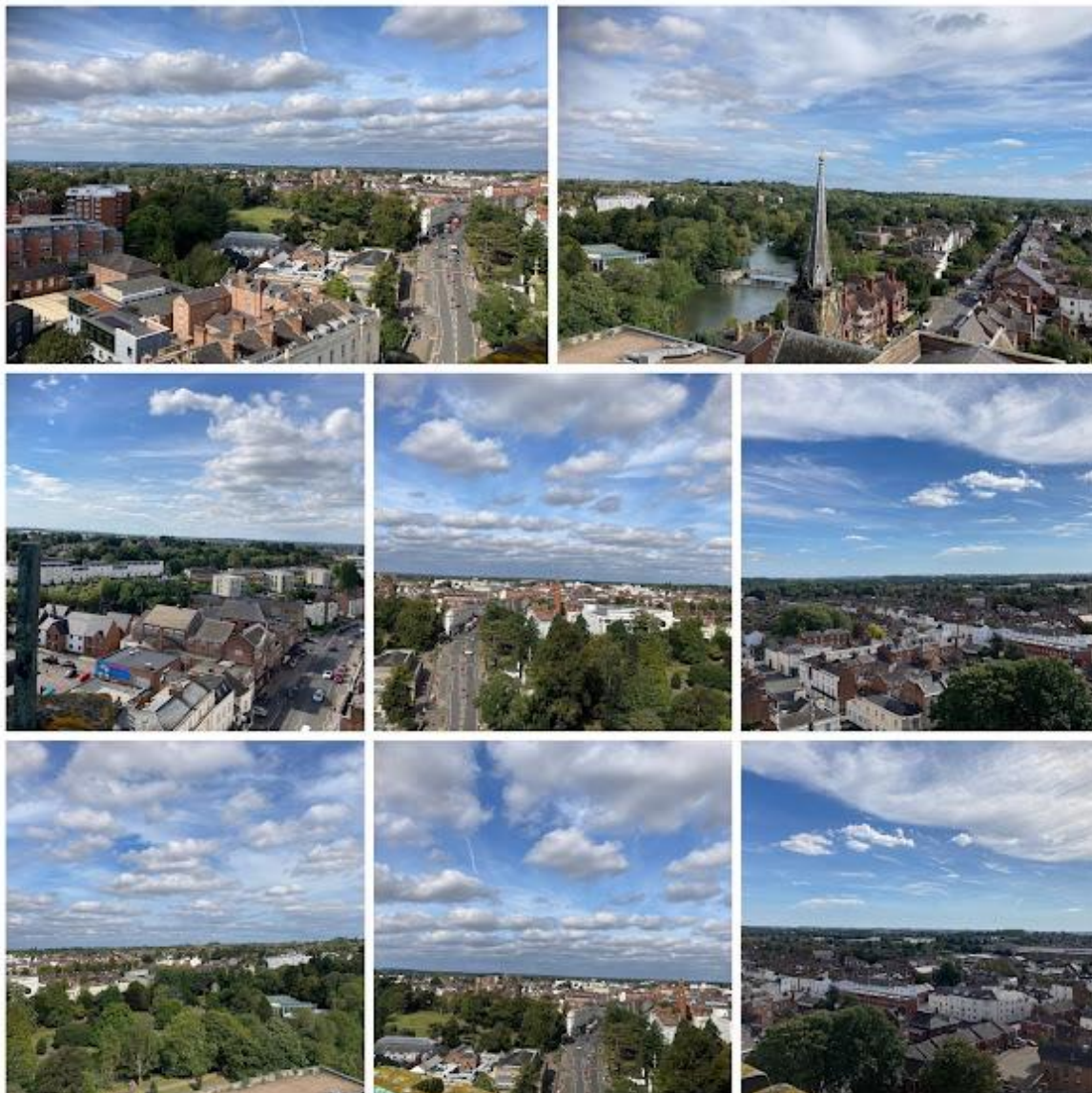
The View from All Saints

2024 - 2025 Season. The full programme of meetings is now available at this link . Please visit our ' Membership ' page to renew your membership or to join WIAS. Gift Aid. Have you added Gift Aid to your membership yet? If you can Gift Aid your membership, WIAS will receive 25p in the £1 from HM Government. Our new 'on line Gift Aid form' is available now at this link and only takes a minute to complete. (A paper form is also available to download and print here ). Thank you for your support! 5th September 2025