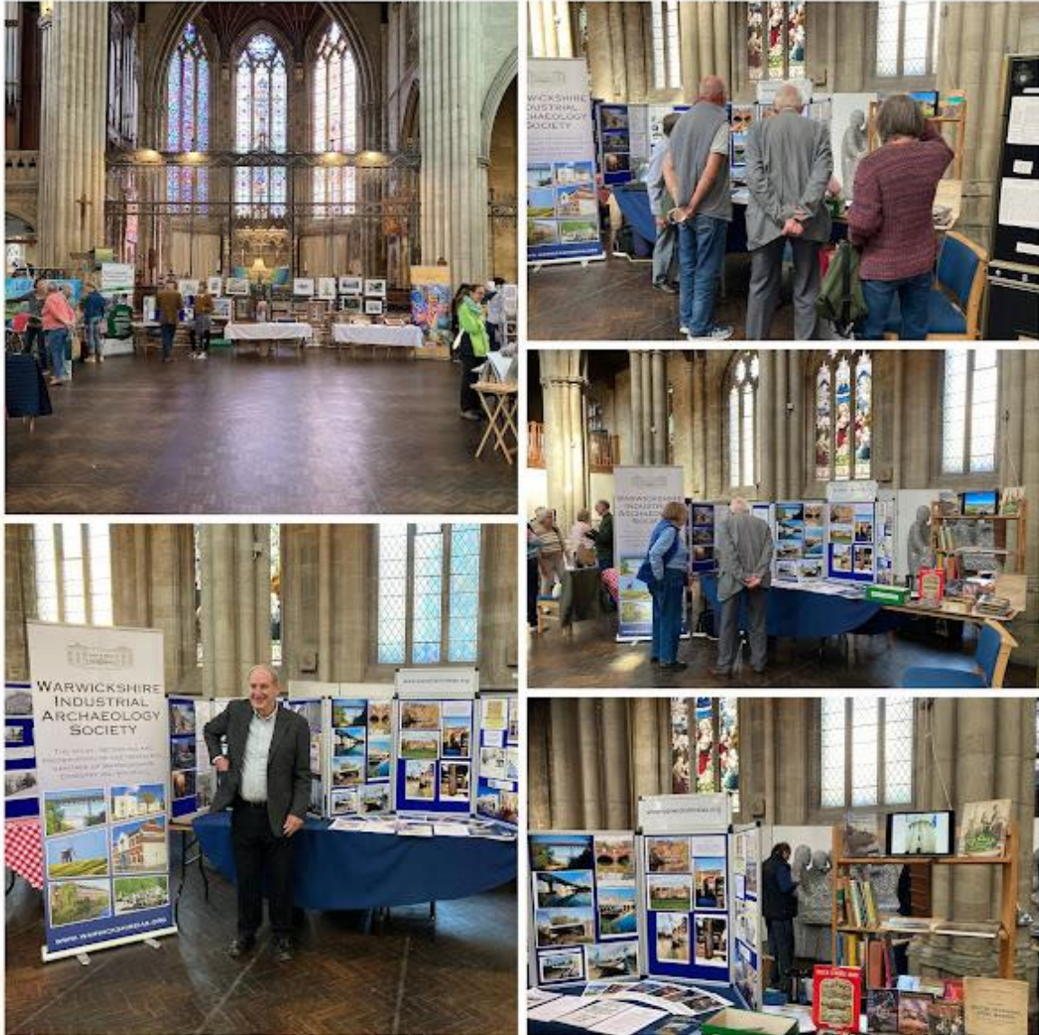
Leamington History Day Stands in the Church

interest, including 3 potential new members, books were sold and leaflets & newsletters distributed. The interior of the church looked splendid and those brave enough were able to climb to the top of the church tower to be rewarded with magnificent clear views of Warwickshire. View all the photos in our gallery here . 14th September 2024